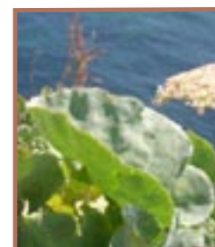
Wild Cabbage 1