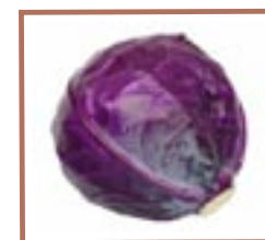
Red Cabbage 4,5